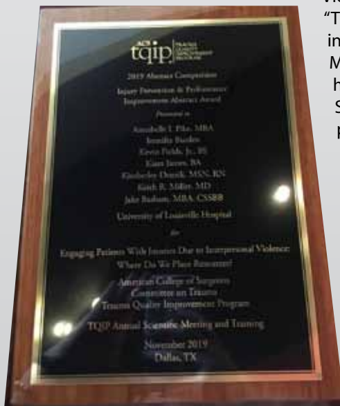
2019 TQIP Injury Prevention & Performance Improvement Abstract Award.